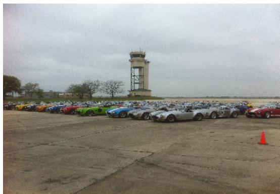
It makes a great desktop background! EL